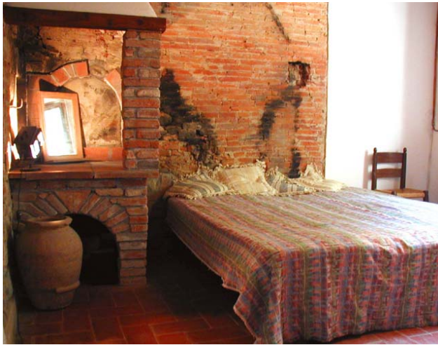
Details that make you feel in a traditional house