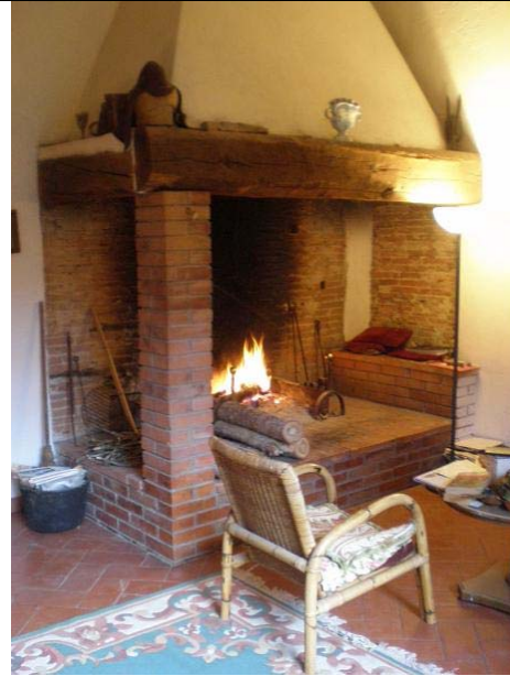
..sit in the traditional Tuscan chimney