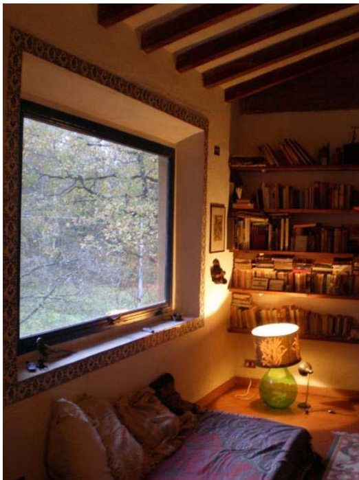
..allway with a view into the season