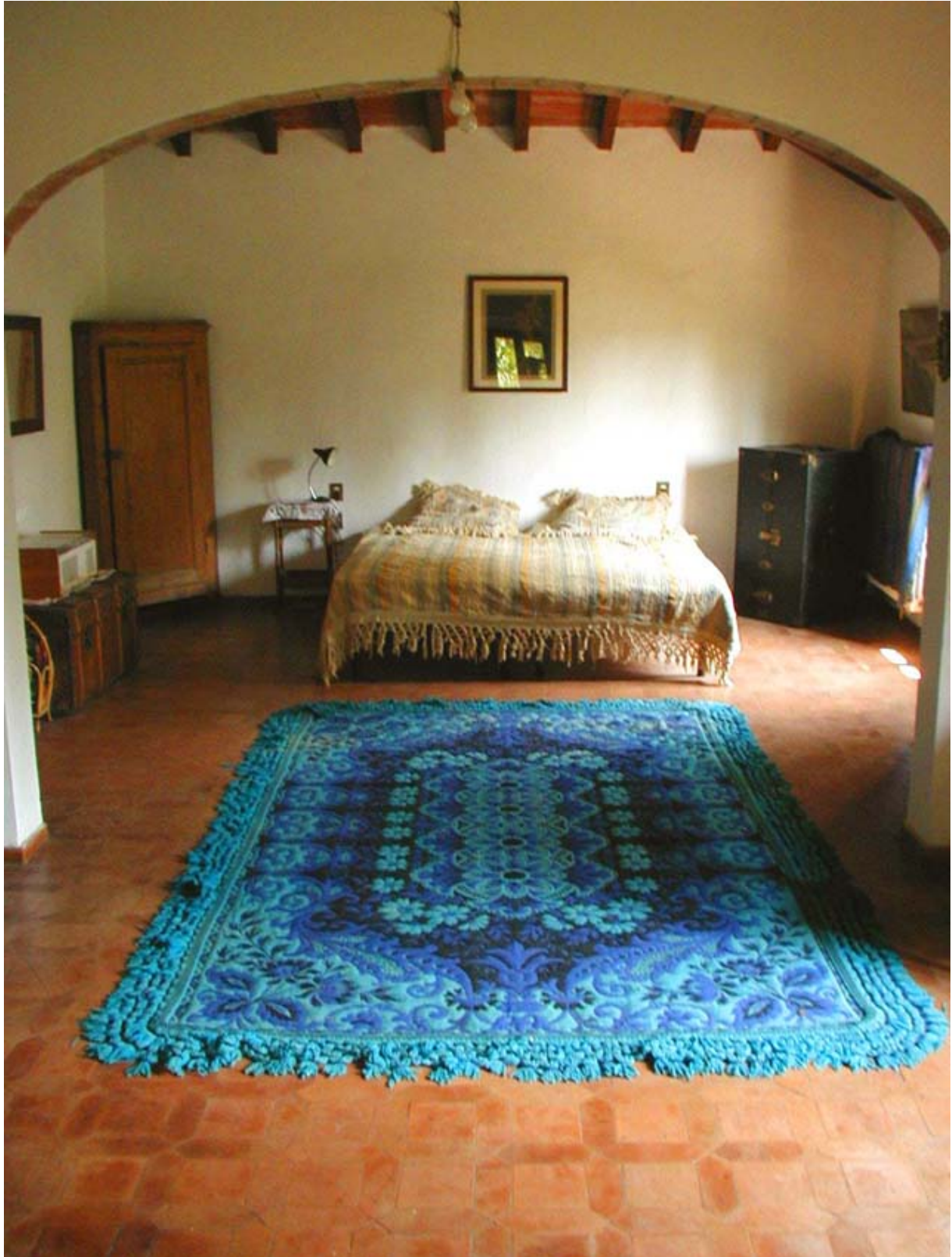
Bedroom with old Terracotta floor