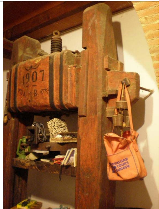
the old olive mill has never moved